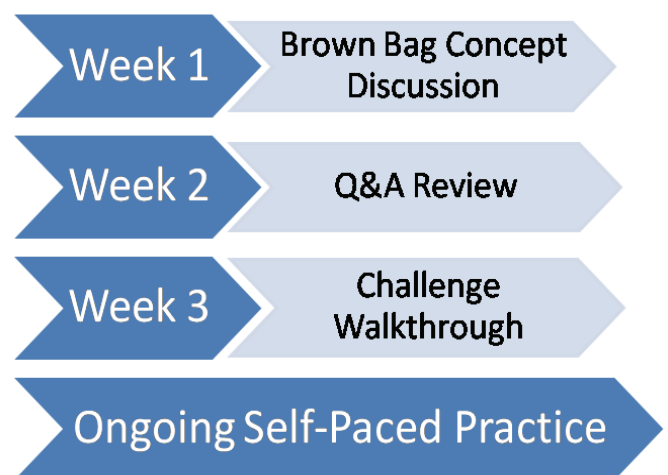
Figure 1: First Data Learning Cycle

In the first week of a cycle, he would lead a ‘brown-bag’ lunch discussion of all concepts covered in the tasks of a particular InnerWorkings challenge. This was followed by a Q&A lunch during week two. The third and final week consisted of a walk-through of the actual learning tasks. Developers were still responsible to complete the challenges individually. Combining the structured brown bag sessions with self-paced practice produced dramatic increases in developer usage and retention.